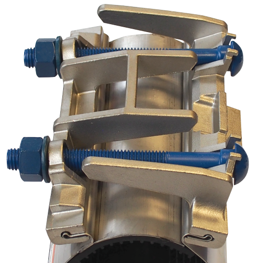
Integrated Handle for Ease of Installation

Note: Product Pressure, Temperature and Bolt Torque can vary depending on Product Diameter, Type of Connection, Line Content and Pipe Material Being Utilized. (Refer to Product Label for Details). The Pressure Rating, Temperature and Bolt Torque shown on product label are the actual ratings of the particular product.