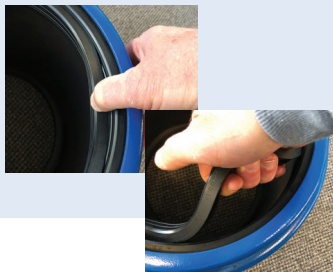
Use your thumb or other device to remove inner gasket layer.