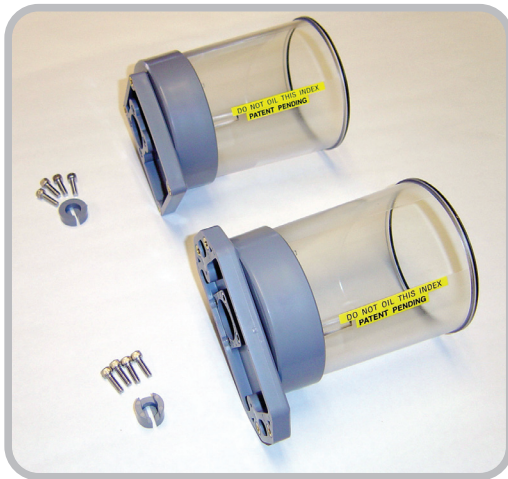
AMR Adapters for Dresser Series B3 meter