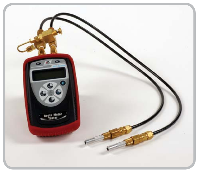
Figure 2 - The Meriam Smart Manometer Handheld, All-Electronic d/p Tester

It has been found over decades of experience that differential testing is an effective method of detecting changes in meter condition. At present, the most effective differential comparison appears to be directly with the initial field data, although factory supplied characteristic data may also be used. Other progress in differential testing is expected as better testing standards are developed and the benefits of experience realized.