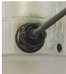
Cable Gland Connector