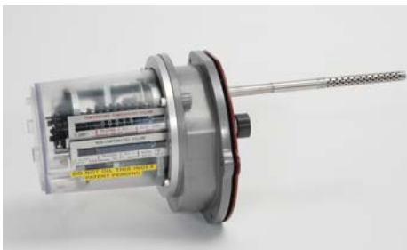
Series S3A TC