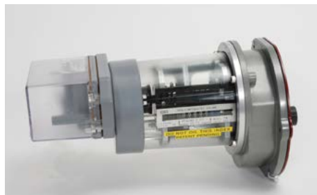
Series S3A CTR/AMR Adapter (shown with Itron ERT installed)