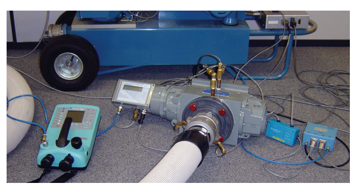
Meter and corrector combined accuracy measurement system including; Model 5 Prover, SmartProve™ Interface and external reference pressure source.

The prover operator only has to press the START button to initiate the test, which is then automatically performed at all the pre-selected test flow rates.