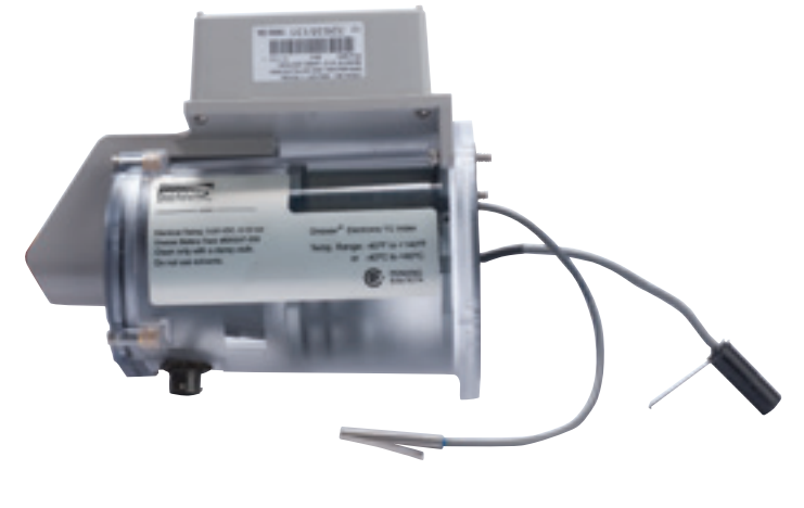
Infrared ETC Prover Cable Connected to Model 5 Prover Field Junction Box