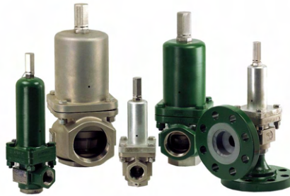
F84L/88 Series Liquid Relief Valve - ASME XIII