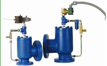
F70U Series Unloader Valve