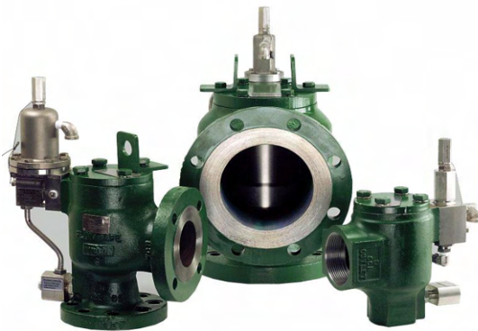
F7000/8000 Series Pilot-Operated Relief Valve - ASME XIII