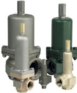
F84/85/88 Series Safety Relief Valve (Gas) - ASME XIII