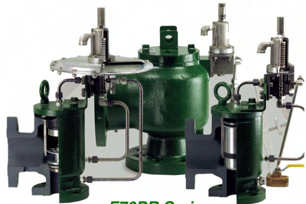
F70PR Series Pilot-Operated Relief Valve - DOT