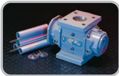
Dresser Series B meter bodies accept a wide range of Series 3 accessories for all metering applications

Dresser meters are manufactured in accordance with ANSI B109.3 for Rotary Type Gas Displacement Meters. Dresser Series B3 ROOTS™ meter sizes 8C through 56M, have flanged inlet and outlet connections conforming dimensionally with ANSI/ASME standards. Sizes 8C through 2M are available with 1-1/2" NPT connections, upon special request. The meter operating temperature range is from -40°F to +140°F (-40°C to +60°C) while the temperature compensating mechanism of the mechanical TC accessory provides a corrected reading for temperatures ranging from -20°F to +120°F (-29°C to +49°C).