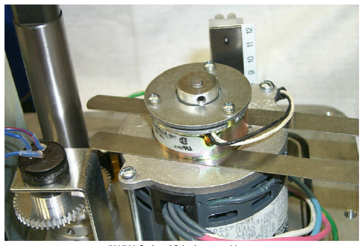
500/800 Series, AC brake assembly