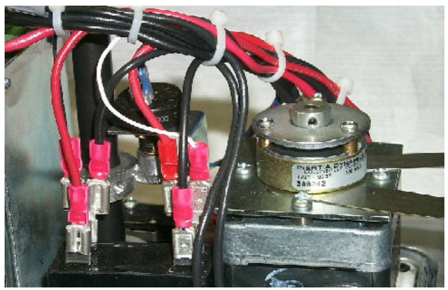
300 Series, AC Brake Assembly